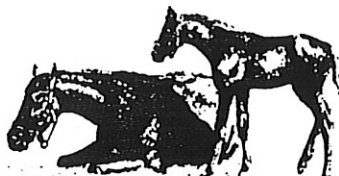
BLACK HORSE RANCH

$15.00 each 57 Western Horse 80 Clydesdale Stallion 83 Clydesdale Mare