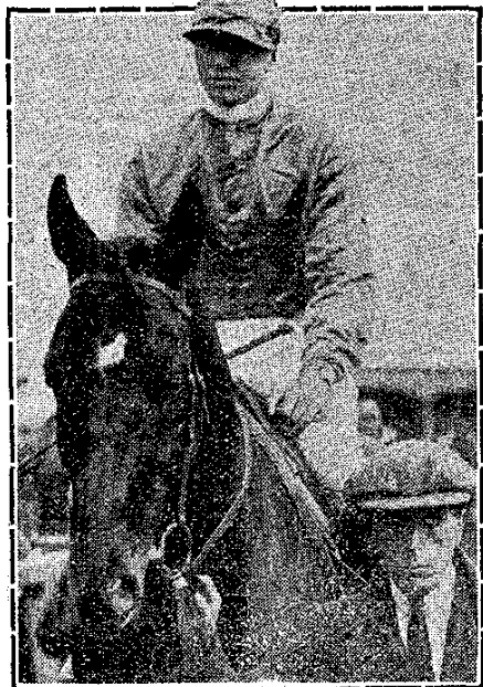
Prince Aly Khan, who led up his Salisbury successes by winning on Chor Bazar at