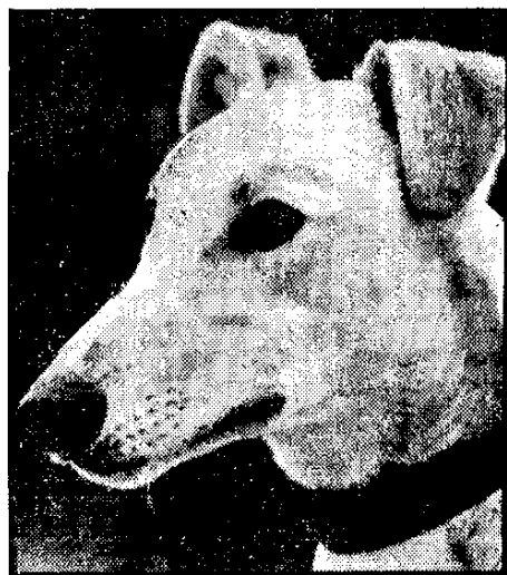
I see no reason to hedge about Grosvenor Bob's chance.

If he can break two national records when his preparation is nothing like complete, what will he do when trained to perfection?