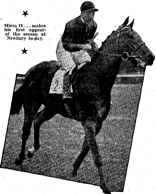
Mirza II... makes his first appearance of the season at Newbury to-day.

At Kingsclere, Campion has been shaping like a stayer in his work, and between them this pair should find any weak link there may be in Mirza's stamina.