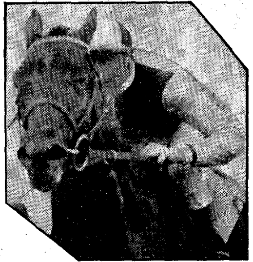
Portmarnock... official two-year-old champion last year and present favourite for the Derby.

It will be less than that if he wins next week—and looking over the likely opposition he should do that right enough if he is half as good as he is supposed to be.