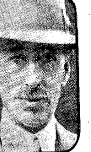
O. Bell, who scored with Ipsden yesterday, should win today with Constellate.