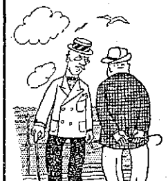
"A black week, Stallybrass! First Tobruk falls, then the Salvage Drive removes the last of the slot-machines."