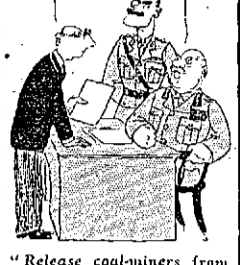
"Release cool-miners from the Army? Certainly not, we like the cold."