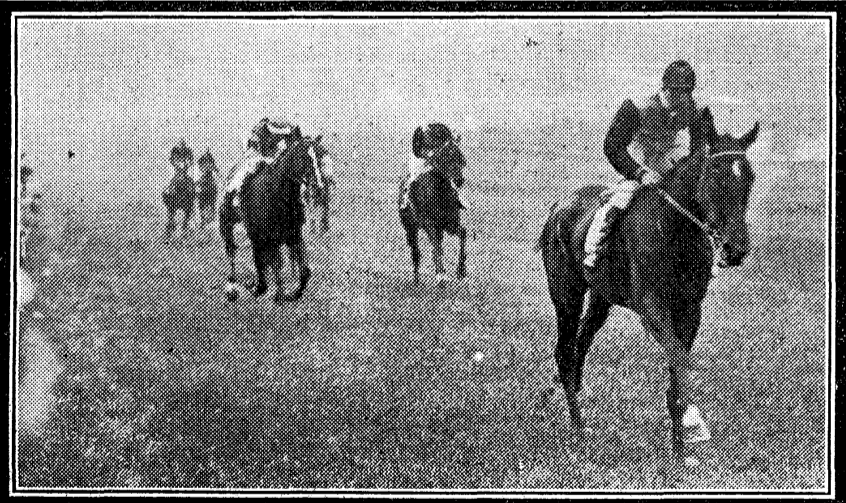
LADY JUROR'S EASY WIN.—The finish of the Jockey Club Stakes at Newmarket yesterday, won easily by Lady Juror (Lane up).