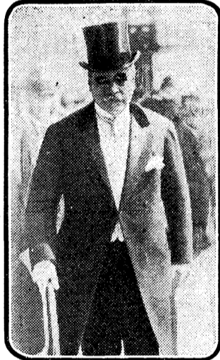
Marquis de Soveral, formerly Portuguese Minister in London, who has been lying ill for some months in Paris, is reported to be sinking. His condition causes the gravest anxiety.