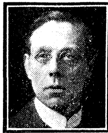
Sir John Bradbury, whose reported resignation as British delegate to the Reparations Commission has been denied by the Treasury.