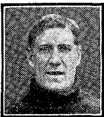
Bombardier Wells, who will meet Jack Bloomfield at Albert Hall on October 12.