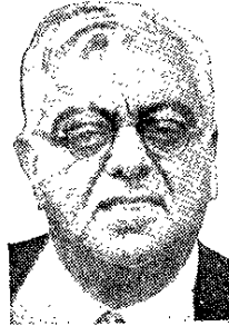
The Aga Khan.

Applan Way, Gordon Richards's mount in the New Nursery, was beaten a furlong from home, and after Dines looked like winning on Four Bells, Auld Reekie challenged and landed a 10 to 1 chance for Dobson Peacock's stable. But if Richards failed here, he rewarded his followers by winning the Scarborough Stakes on Feather Boy. Long odds were bet on Cecil, but judging by the cheers that greeted