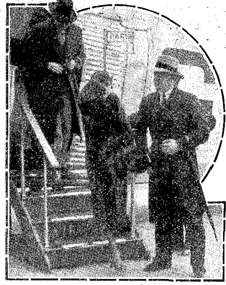
Prince Alexis Mdivani (light hat) and his Princess, formerly Miss Barbara Hutton, the Woolworth heiress, stepping from the airliner in which they flew from Paris to Croydon yesterday before leaving for India.