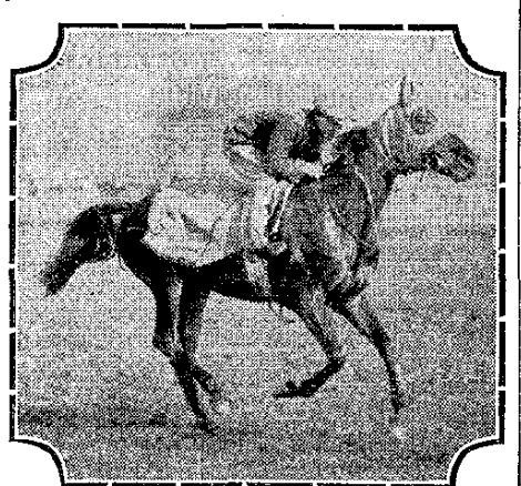
Red Horizon, which is expected to score his sixth successive victory to-day.

at the previous meeting and, in spite of the slight alteration in the weights, may do so again in the Old Nursery. Queen's Hotel, who proved her stamina when she finished third