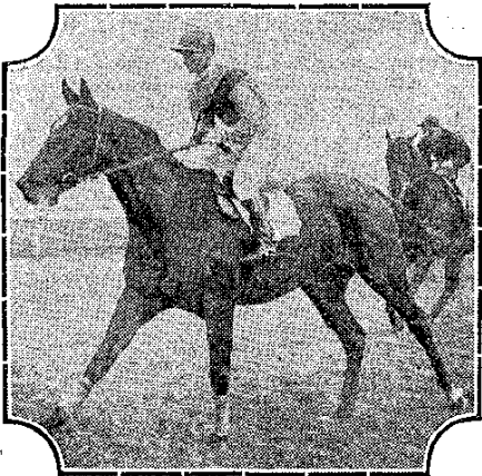
Chatelaine who runs in the Coronation Cup to-day.

It is stated that Newcastle United F.C. will show a loss of a few thousand pounds on the season, the transfers accounting largely for the deficit.